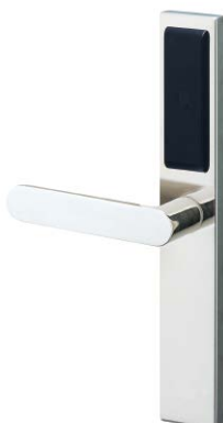
Polished Stainless Steel Finish (SB)