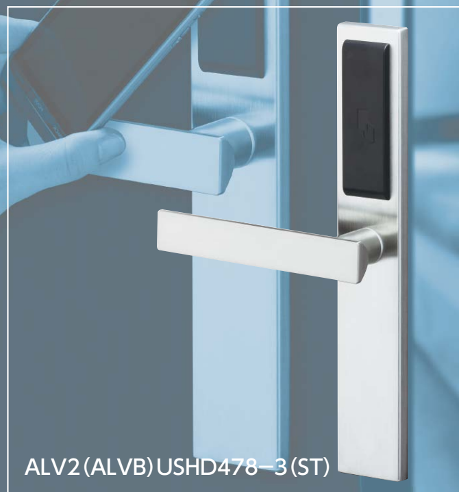
ALV2 (ALVB) USHD478-3 (ST)