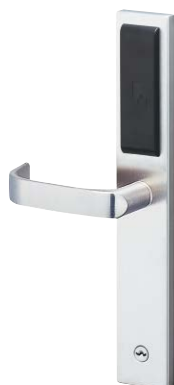
Satin Stainless Steel Finish (ST) Key Override available as an option.