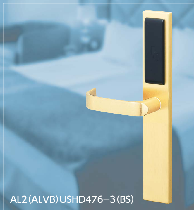
AL2 (ALVB) USHD476-3 (BS)

The pressed stainless steel escutcheon is available as standard in 5 high-quality finishes.