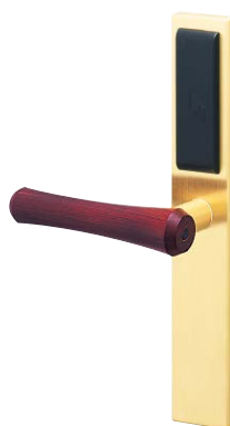
Satin Brass Finish (BS)