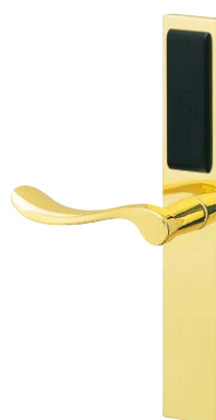
Polished Brass Finish (YB)