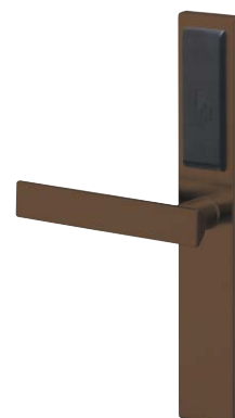
Mid Bronze Finish (CB)

The ALV2 hotel lock from MIWA has passed the ANSI 156.25 test confirming its status as a "Grade 1" electronic mortise lock.