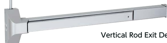
Vertical Rod Exit Device