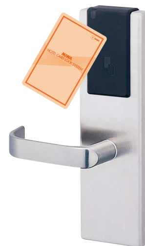
Out door side : ALV2(ALVB)-P type