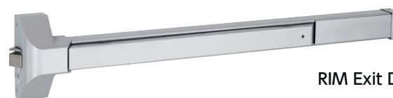
RIM Exit Device