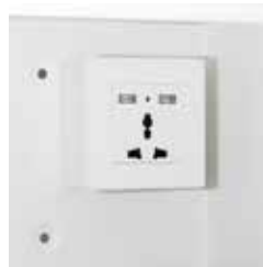
Inner socket with USB

Technology is the great protagonist. With programmable opening through any chip card.