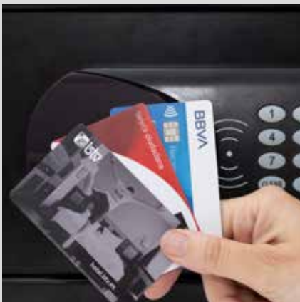
Programmable opening through any chip card

Technology is the great protagonist. With programmable opening through any chip card.