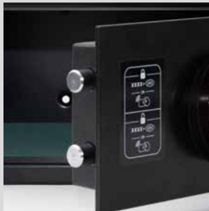
High security bolts