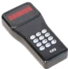
Audit on PC through the CEU handheld unit